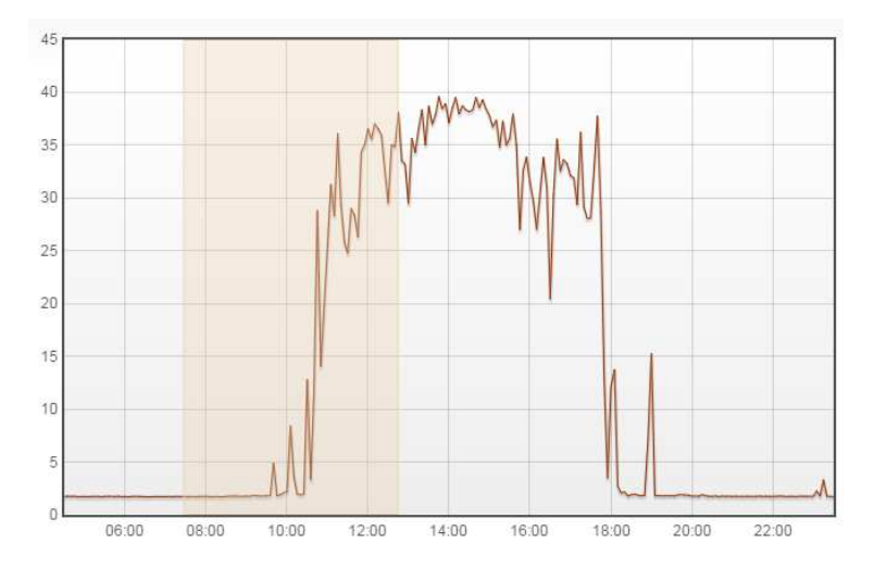
Figure 2: A time-series of RTT from a university in Hong Kong to www.atnext.com.

will launch QoE crowdtesting by enlisting workers from that university to stream video clips from Akamai in order to assess the impact on QoE.